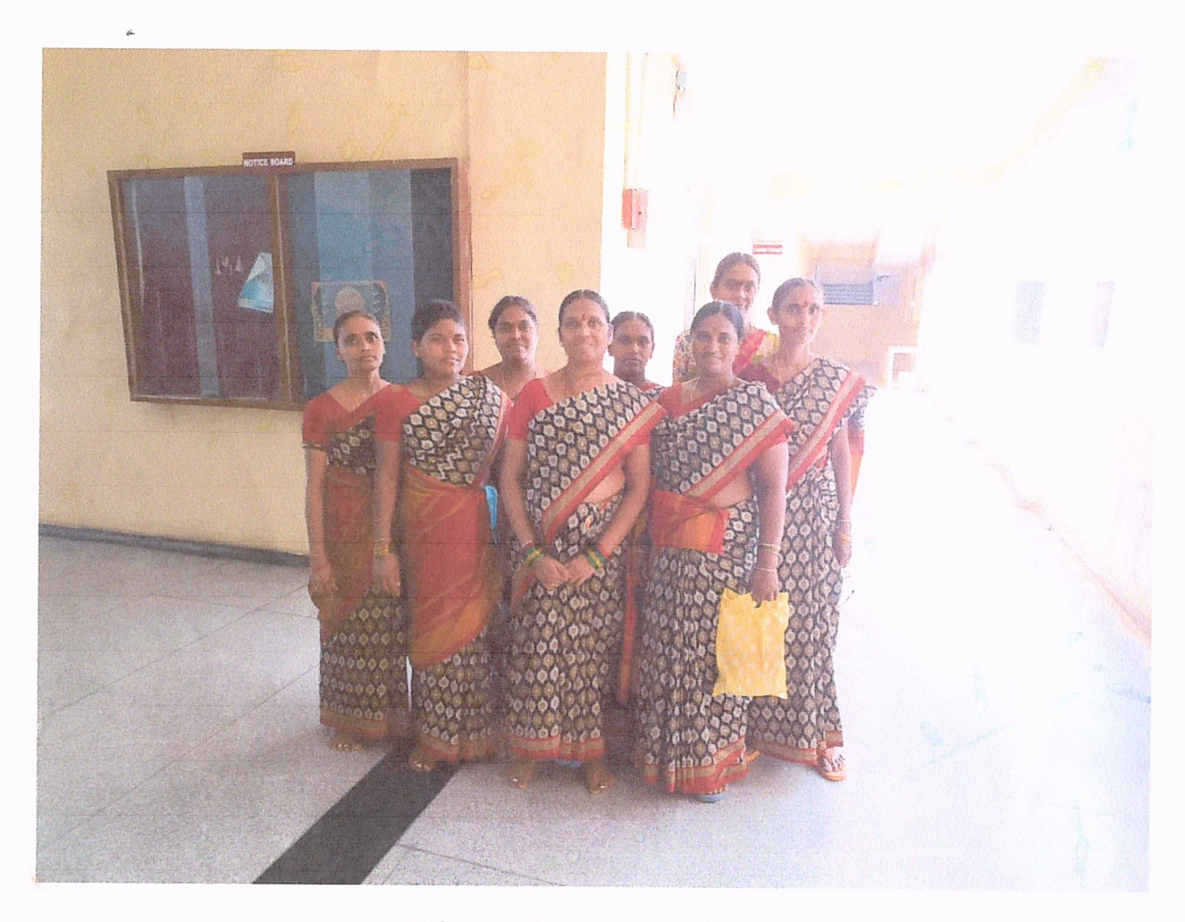
Uniform to Class Four Employees